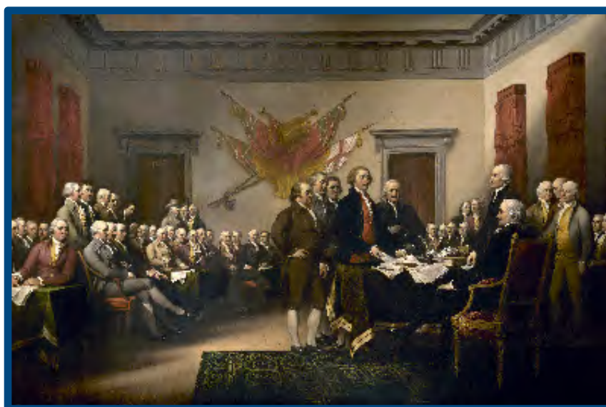
Signing of the Declaration of Independence