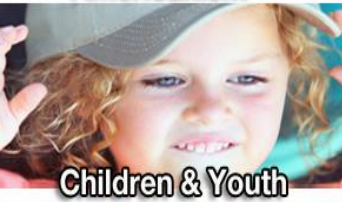
Children & Youth