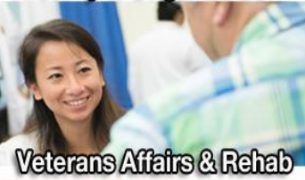
Veterans Affairs & Rehab