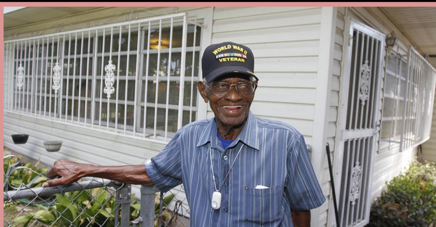
Nation’s oldest living veteran Richard Overton dies in Austin, TX at the age of 112.

Membership eligibility in The American Legion is based on honorable service within the U.S. Armed Forces between April 6, 1917 and November 11, 1918 (World War I); December 7, 1941, and December 31, 1946 (World War II); June 25, 1950, and January 31, 1955 (Korean war); December 22, 1961, and May 7, 1975 (Vietnam War); August 24, 1982, and July 31, 1984 (Lebanon/Grenada); December 20, 1989, and January 31, 1990 (Operation Just Cause – Panama); or August 2, 1990, until the date of the end of hostilities as determined by the government of the United States.