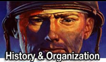
History & Organization