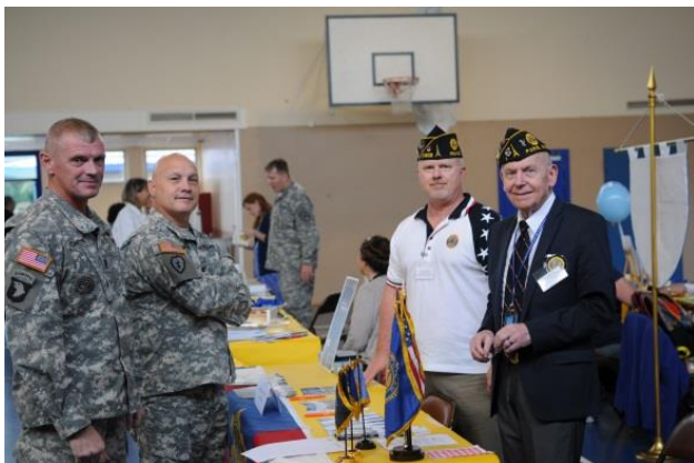
Brussels Information Fair 18 September 2014