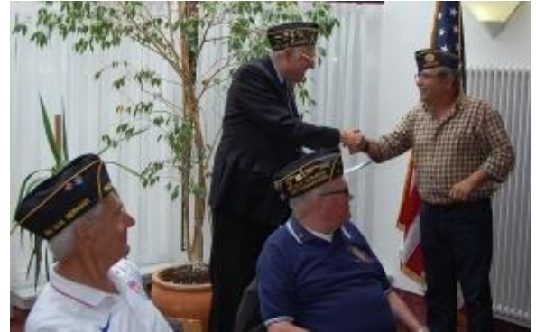
GR09 Post Legionnaire of the Year