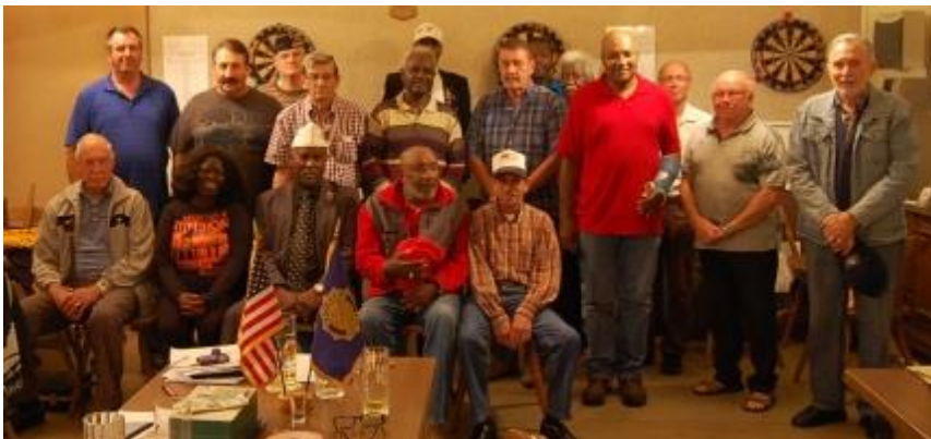
GR13 Membership Meeting