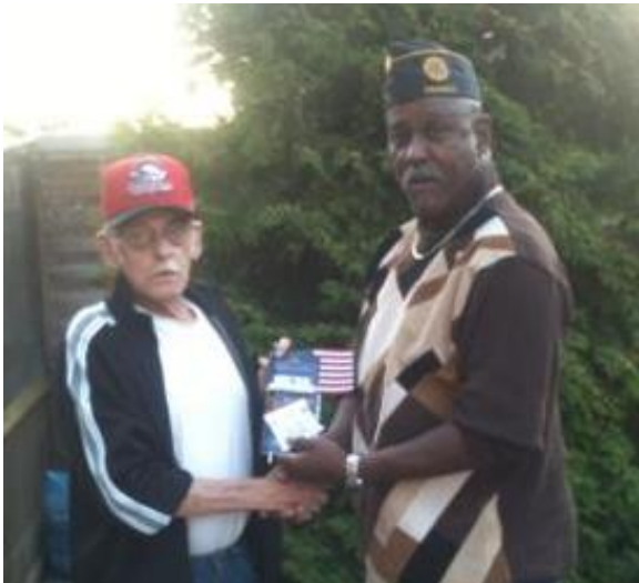
GR79 New Member from USA