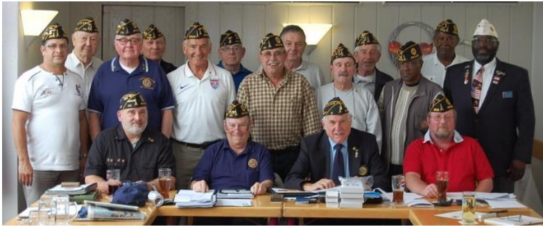
GR09 Membership Meeting