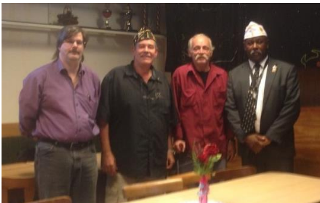
GR42 General Membership Meeting