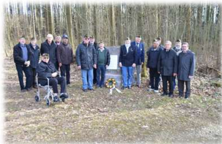
Group photo of participants in wreath laying ceremony