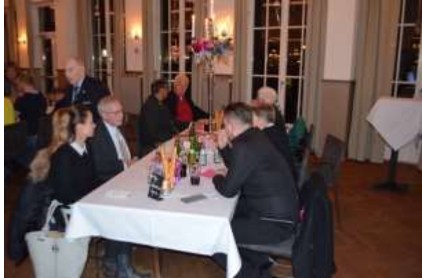
Some of the GR 09 attendees at the book presentation