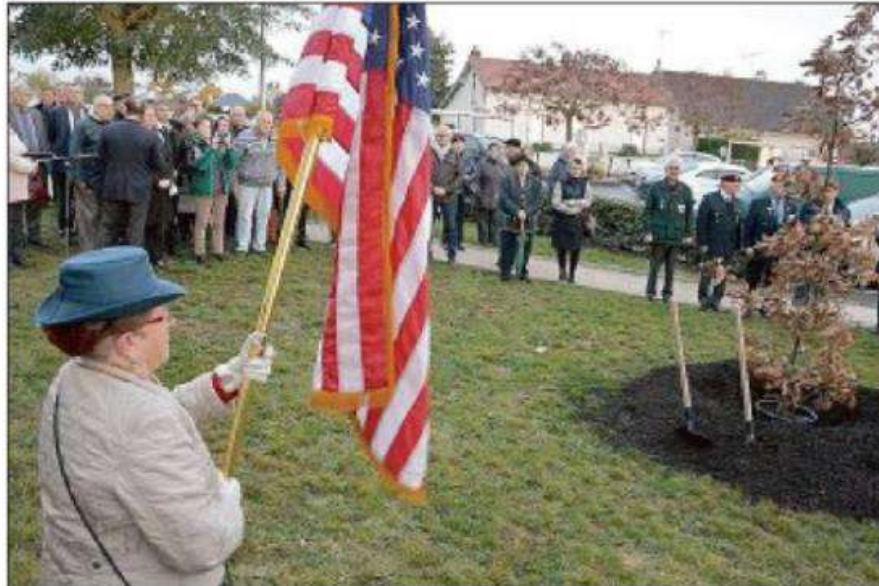
Derrière l'église de Villemandeur, un chêne a été planté vendredi dernier.

Les feuilles de cette variété américaine sont rouges, comme le sang des soldats d'Outre-Atlantique