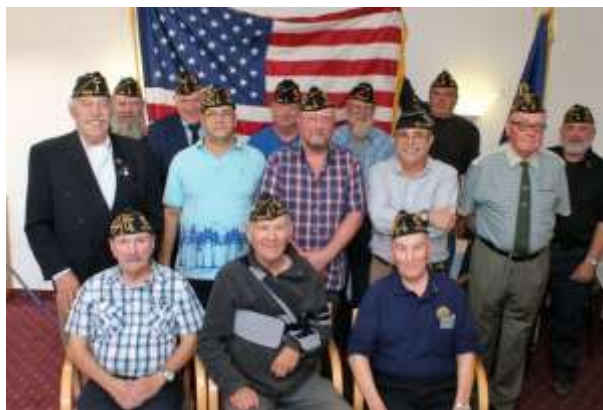
GR 09 members as pictured in book