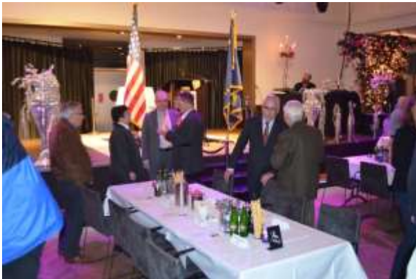
US Flag and GR 09 colors prominently displayed during event