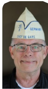
Grande Chef de Gare 2020MY

Membership is by invitation, and open only to honorably discharged veterans and honorably serving members of the United States Armed Forces.