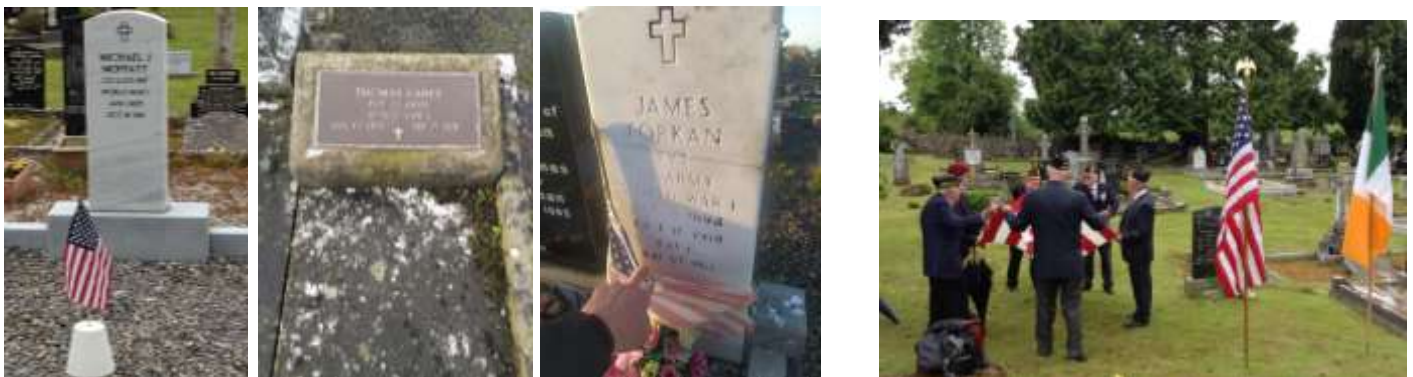
(this picture taken 2017)

To date, American Legion post Ireland 03 has officiated at 22 WW1 graveside ceremonies, 21 for soldiers who were killed in action and one ceremony for a soldier who survived the war, came back to Ireland and lay for 66 years in a grave where his service was unacknowledged. His three children attended our graveside ceremony, the youngest being 81 years. On one occasion, the American Legion and the Mayo Peace Park participated in carrying out full military honors for four soldiers in a single day. Due to Covid-19, our post has not been able to work on preparing further WW1 graves. Remember, Honor those who served and may all the Irish that served with the US Armed forces that gave their lives for an adopted country rest in peace.