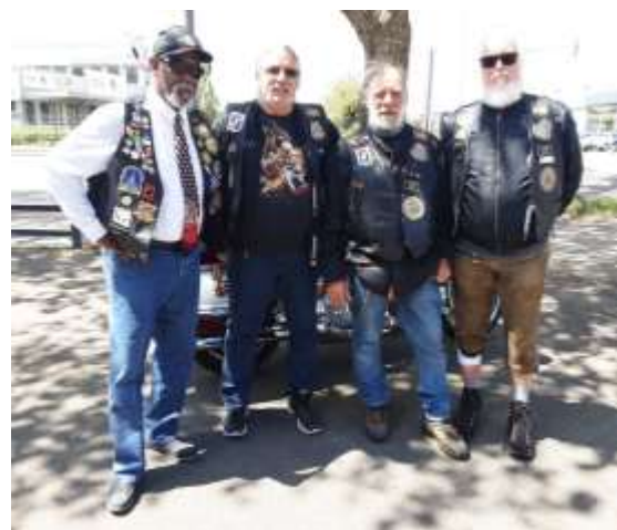
GR79 Legion Riders