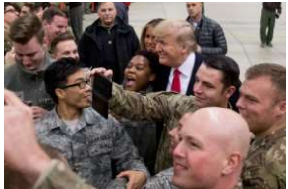
President Donald Trump and first lady Melania Trump greet members of the military at Ramstein Air Base, Germany, Thursday, Dec. 27, 2018.