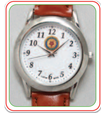
▲ Affix to your Acceptance Certificate

To start receiving member benefits, just complete the short American Legion Acceptance Certificate enclosed. Upon receipt, we'll send a custom-made welcome gift, a stylish wristwatch imprinted with the emblem of The American Legion.