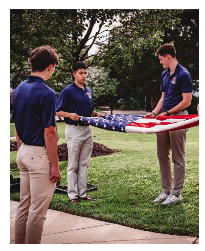
The American Legion | Legislative Priorities

The American Legion led national conferences in 1923 and 1924 that established the first rules of U.S. flag respect for the nation. Those guidelines laid the groundwork for what would be passed as U.S. Flag Code in 1942. Modern practices at massive public events, such as professional sports contests, frequently run counter to the code, and The American Legion calls for an amendment to modernize the guidelines that would make exceptions for common patriotic expressions of that magnitude that may include, for instance, displaying the flag in a horizontal position.