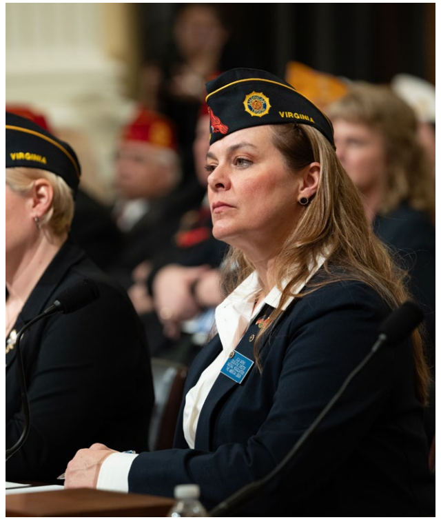
The American Legion | Legislative Priorities